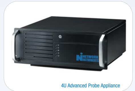
4U Advanced Probe Appliance

Independent, Proven and Trusted View of Network Traffic Hardware-based Gigabit Probes are specifically for administrators that require wire-speed, full-duplex gigabit capture. Gigabit Probes provide a direct, passive link into the data stream, resulting in an accurate view of all network traffic without disruption of the Gigabit network. Network Instruments' Gigabit Probes are available as a Probe Kit for easy installation into an existing system or as a 4U rack mount Probe appliance. Gigabit Probes can also be purchased pre-configured for HCRMON support.