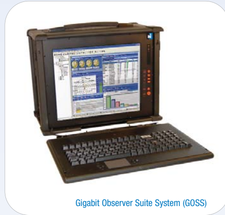
Gigabit Observer Suite System (GOSS)

The Gigabit Observer Suite System combines the award-winning Observer Suite functionality with the 64-bit hardware and software required to provide wire-speed analysis in a fully ruggedized, luggable format to meet any high-end network administrators needs. This system brings the powerful Observer Suite console and full-duplex Gigabit probe into one complete solution. The GOSS is a completely passive analysis option that offers an independent view of your data flow, without disruption of the Gigabit network. The GOSS also fully supports Jumbo Frames. No additional hardware or software required.