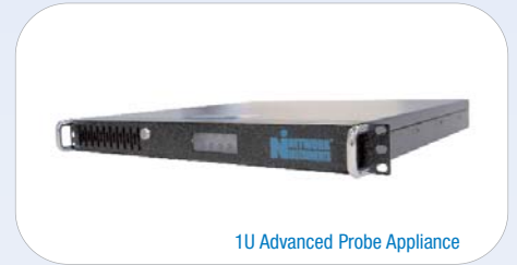
1U Advanced Probe Appliance

The Advanced Probe Appliance provides the enormous power and functionality of the Network Instruments Advanced Probe into a space saving, easy-to-install, rack mount system. Install these light, slim systems anywhere on your network and get full visibility from any Observer console. These 1U or 4U systems support Ethernet (10/100/1000) and come pre-configured as an RMON/HCRMON unit, Advanced Single Probe or Advanced Multi-Probe.